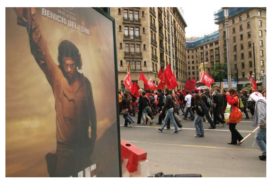
Inspiration is important if you want to get your fellow students into the streets

Hope, Action«. The idea is that if you make them angry about your campaign problem, then give them hope that solution exists they will then agree to take the action you suggest to support your campaign.