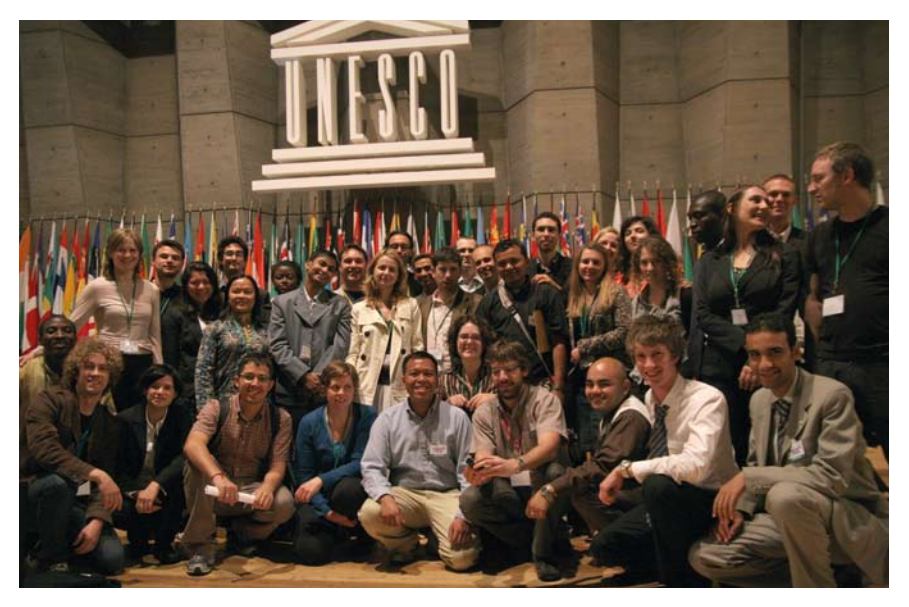
Student representatives at UNESCO's World Conference on Higher Education in Paris, July 2009.