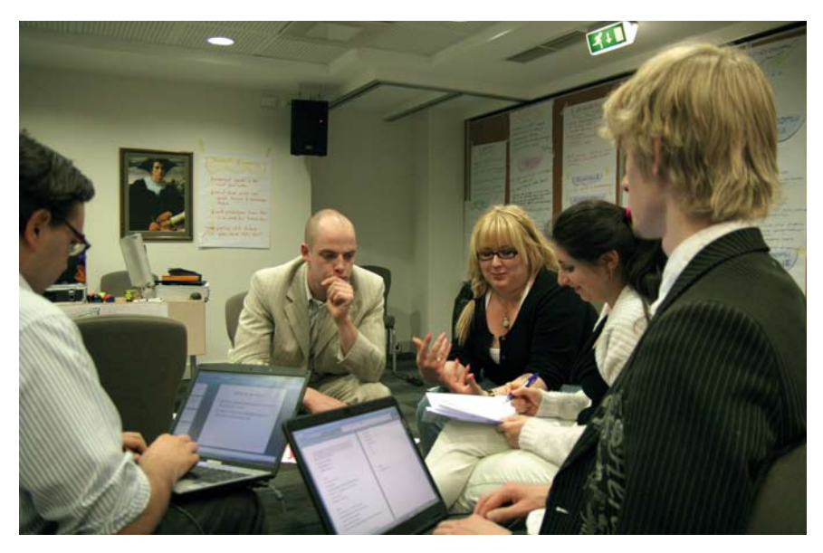
Student representatives develop a campaign on how to achieve more gender equality in the field of nursing education

been collecting existing research on equity in higher education and creating a full package with articles, summaries and data, used to support the content development of other parts of the project. The content package will be available on the e-learning platform so that student representatives can read it and learn more about equity.