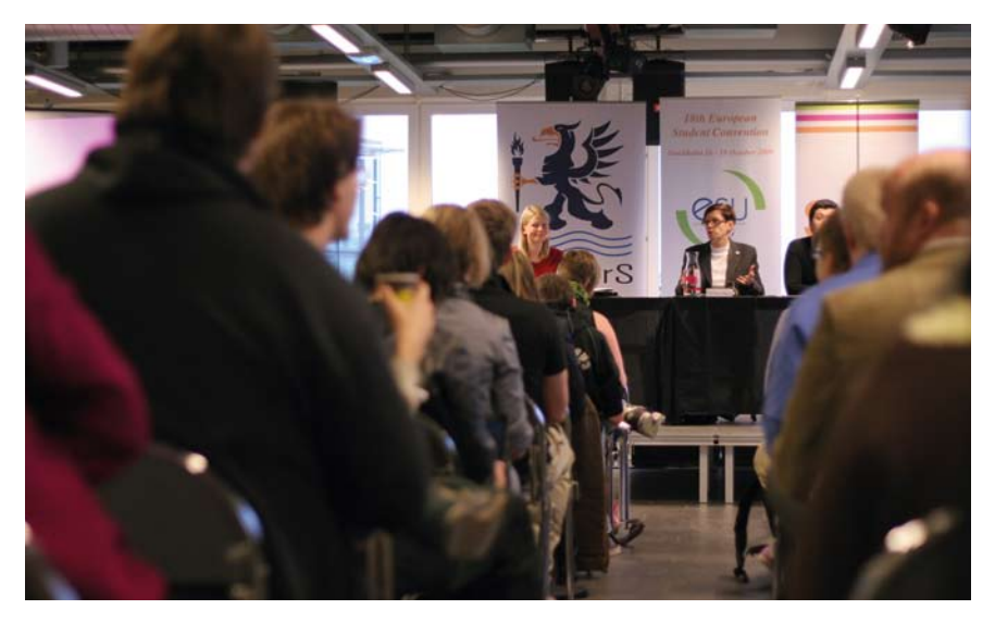
Panel discussion on gender equality during ESU's 18th Student Convention in Stockholm, October 2009.

At each major ESU event, there is an agenda item that includes discussions on gender issues in higher education and within ESU in particular. ESU has also published a Gender Equality Handbook, which can be downloaded from the webpage esu-online.org .