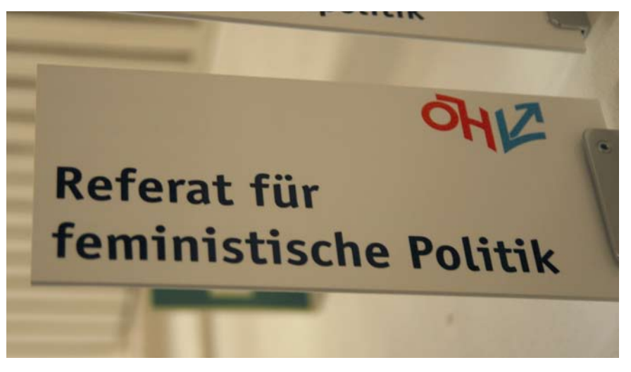
Department sign at the headquarters of the Austrian national union of students

The second one concerns students with child care responsibilities. Board meetings of ÖH usually start around 1 pm and last well into the night. Student with children thus have to find adequate child care during those times. This often costs money. Starting with this autumn, delegates to the board meeting as well as the committees will be able to get a refund for the costs incurred. This fact will also be advertised on every invitation so as to ensure widespread knowledge of this measure.