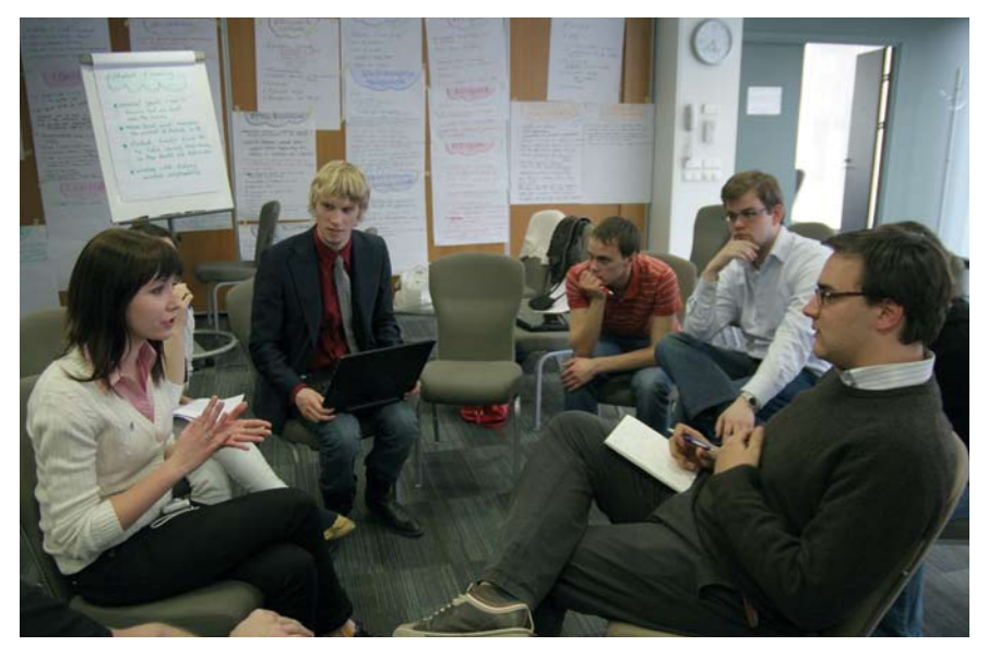
Student representatives discuss equal opportunities during ESU's equity training in Tallinn in April 2009.

which means that you are responsible for ensuring that other members of your union don't abuse the facilities and services that you offer. The model harassment policy is a good step to take in making sure that bullying and abuse will not be tolerated in your union.