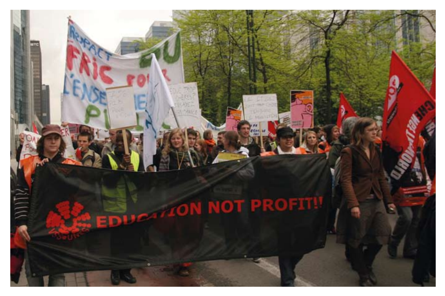
Students protest against tuition fees and lack of public financing for higher education in Brussels, April 2009.

In order to achieve this goal, actions needs to be undertaken in areas that are not within the EU's mandate. A tool was set up to coordinate action between the member states: the Open Method of Coordination (OMC). This is based on the naming-framing-shaming principle. The European Commission and the Council of Ministers agree upon a common goal and set out some benchmarks. Progress is measured at regular intervals and reports are published. The group pressure should stimulate low-scoring countries to improve. Important to note is that the European Commission is the driving force (which is not the case in the Bologna Process). The decision making power, however, remains with the ministers.