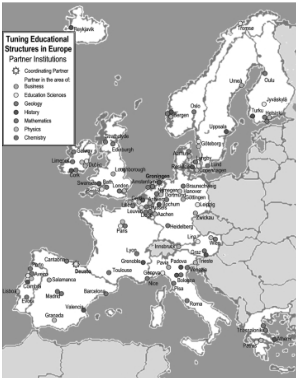
Map of the Tuning Member Institutions